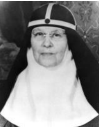
Saint Mary Elizabeth Hesselblad Also known as Maria Elizabetta Hesselblad

The disciples of Jesus recounted what had taken place along the way, and how they had come to recognize him in the breaking of bread. While they were still speaking about this, he stood in their midst and said to them, "Peace be with you." But they were startled and terrified and thought that they were seeing a ghost. Then he said to them, "Why are you troubled? And why do questions arise in your hearts? Look at my hands and my feet, that it is I myself. Touch me and see, because a ghost does not have flesh and bones as you can see I have." And as he said this, he showed them his hands and his feet. While they were still incredulous for joy and were amazed, he asked them, "Have you anything here to eat?" They gave him a piece of baked fish; he took it and ate it in front of them. He said to them, "These are my words that I spoke to you while I was still with you, that everything written about me in the law of Moses and in the prophets and psalms must be fulfilled." Then he opened their minds to understand the Scriptures. And he said to them, "Thus it is written that the Christ would suffer and rise from the dead on the third day and that repentance, for the forgiveness of sins, would be preached in his name to all the nations, beginning from Jerusalem. You are witnesses of these things."