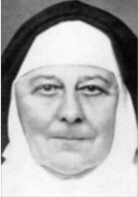
Saint Mary Euphrasia Pelletier Also known as Euphrasia Pelletier, Marie of Saint Euphrasia, Mary Sainte-Euphrasie Pelletier, Rose Virginie Pelletier, Rose-Virginie Pelletier

Born during the French Revolution. Studied at Tours, France. Joined the Refuge of Our Lady of Charity at Tours on 20 October 1814, an order devoted to rescuing "fallen" women and those in danger of going on the game. She took the name Marie-Euphrasie, and made her religious profession on 9 September 1817. Superioress on 26 May 1825. Founder of The Congregation of Our Lady of Charity of the Good Shepherd (Good Shepherd Sisters) at Tours on 11 November 1825, and established their monastery at Angers, France on 31 July 1829; this congregation has the same mission, but is a contemplative order. She was recognized as Superior-General of the Congregation on 9 January 1831, and received approval from Pope Gregory XVI on 16 January 1835. The Congregation has sisters working in Italy, Germany, Belgium, England, Algeria, the United States, Canada, Egypt, Ireland, Austria, India, Chile, Malta, the Netherlands, Australia, and Myanmar. By the end of her life, there were over 2,000 sisters established in 100+ houses on five continents; this rapid expansion led to her being known as a patron of travellers. Bom 31 July 1796 at Noirmoutier, Vendée, France as Rose Virginie Pelletier