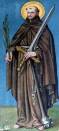
Saint Fidelis of Sigmaringen Also known as the poor man's lawyer, Mark Rey