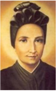
Saint Maddalena of Canossa Also known as Magdalena Gabriela Canossa, Magdalen Canossa

Born: 29 September 1591 at Vich, Catalonia, Spain Died: 10 April 1625 at Valladolid, Spain of natural causes Canonized: 8 June 1862 by Pope Pius IX.