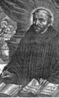
Saint Fulbert of Chartres Also known as Fulbertus of Chartres

are possessed. Abraham died, as did the prophets, yet you say, 'Whoever keeps my word will never taste death.' Are you greater than our father Abraham, who died? Or the prophets, who died? Who do you make yourself out to be?" Jesus answered, "If I glorify myself, my glory is worth nothing; but it is my Father who glorifies me, of whom you say, 'He is our God.' You do not know him, but I know him. And if I should say that I do not know him, I would be like you a liar. But I do know him and I keep his word. Abraham your father rejoiced to see my day; he saw it and was glad." So the Jews said to him, "You are not yet fifty years old and you have seen Abraham?" Jesus said to them, "Amen, amen, I say to you, before Abraham came to be, I AM." So they picked up stones to throw at him; but Jesus hid and went out of the temple area.