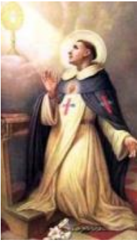
Saint Miguel de Sanctis Also known as Michael de Sanctis, Michael of the Saints, Michael the Ecstatic

Born: c.960 in Italy Died: 10 April 1029 in Chartres, France of natural causes.