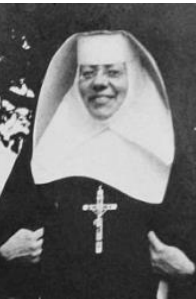
Saint Katharine Drexel Also known as Catherine Marie Drexel

Gospel: Mark 10:17-27 As Jesus was setting out on a journey, a man ran up, knelt down before him, and asked him, ""Good teacher, what must I do to inherit eternal life?"" Jesus answered him, ""Why do you call me good? No one is good but God alone. You know the commandments: You shall not kill; you shall not commit adultery; you shall not steal; you shall not bear false witness; you shall not defraud; honor your father and your mother."" He replied and said to him, ""Teacher, all of these I have observed from my youth."" Jesus, looking at him, loved him and said to him, ""You are lacking in one thing. Go, sell what you have, and give to the poor and you will have treasure in heaven; then come, follow me."" At that statement, his face fell, and he went away sad, for he had many possessions. Jesus looked around and said to his disciples, ""How hard it is for those who have wealth to enter the Kingdom of God!"" The disciples were amazed at his words. So Jesus again said to them in reply, ""Children, how hard it is to enter the Kingdom of God! It is easier for a camel to pass through the eye of a needle. than for one who is rich to enter the Kingdom of God." They were exceedingly astonished and said among themselves, "Then who can be saved?" Jesus looked at them and said, "For men it is impossible, but not for God. All things are possible for God."