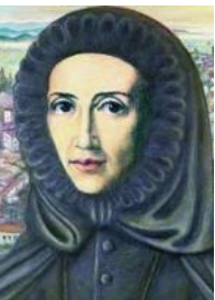
Saint Teresa Eustochio Verzeri Also known as Ignazia Verzeri