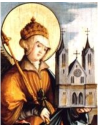
Saint Cunegundes Also known as Chunigundis, Cunnegunda, Cunigunde, Cunegonda, Kinga, Kunegunda, Kunigunde