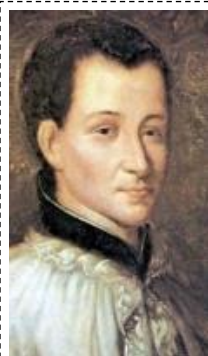
Saint Claude de la Colombiere Also known as Claudio, Claudius

Born to the French nobility, Claude early felt a call to religious life. Educated at Jesuit college in Lyons, France. Priest. Taught humanities at Avignon, France. Continued his studies in Paris, France. Tutor. Preached against Jansenism, advocating dedication to the Sacred Heart of Jesus. Joined the Jesuits in 1659. Spiritual director of Saint Margaret Mary of Alcoque. Chaplain to Mary Beatrice d'Este, the Duchess of York. He converted many Protestants through the example of his holy life. Due to rumours of "Popish plots" against the king and the re-establishment Catholicism, Claude was imprisoned, accused of being part of the Titus Oates Plot. It was only by the efforts of Louis XIV, who had recommended him for the assignment, that he was not martyred. Banished from England. His health had been ruined by his time in prison, and he returned to Paray to die. The day after his death, Saint Margaret received supernatural assurance that Claude needed no prayers, as he was in already heaven. He is considered a "dry" martyr, having suffered every abuse for the faith except death.