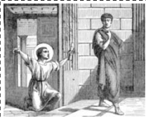
Saint Onesimus the Slave