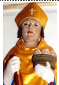
Saint Sigfrid of Sweden

Also known as Apostle of Sweden, Sigfrid of Vaexjoe, Sigfrid of Växjö, Sigfrid of Wexlow, Sigfried, Siegfried