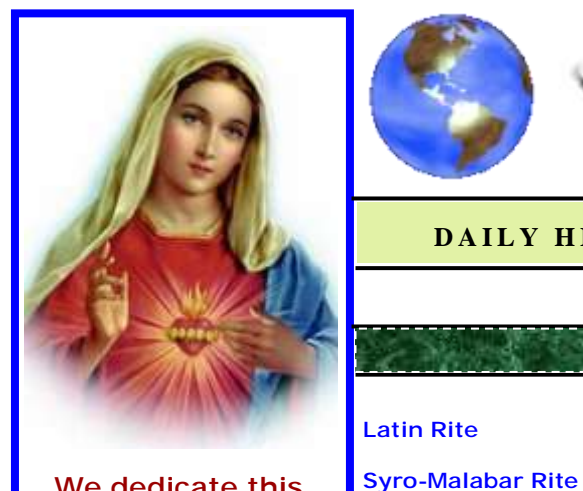
We dedicate this website to the Generous Heart of Mother Mary