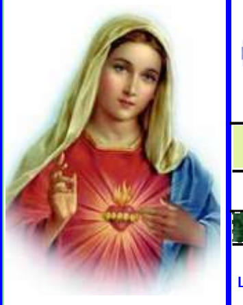
We dedicate this website to the Generous Heart of Mother Mary