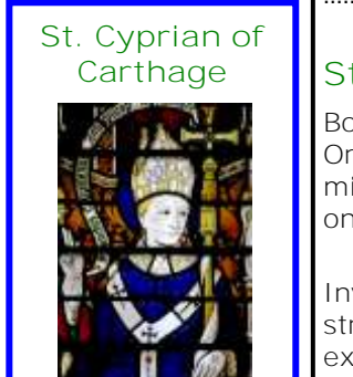
St. Cyprian of Carthage

Patronage: • against earache; earache sufferers • epileptics; against epilepsy • against fever • against twitching • cattle • domestic animals • Kornelimünster, Germany