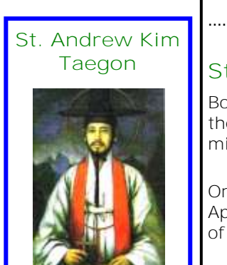
St. Andrew Kim Taegon

Patronage: • Algeria (proclaimed on 6 July 1914 by Pope Pius X) • North Africa (proclaimed on 6 July 1914 by Pope Pius X, on 10 January 1958 by Pope Pius XII, and on 27 July 1962 by Pope John XXIII) editor's note - no, I don't know why it was done so many times)